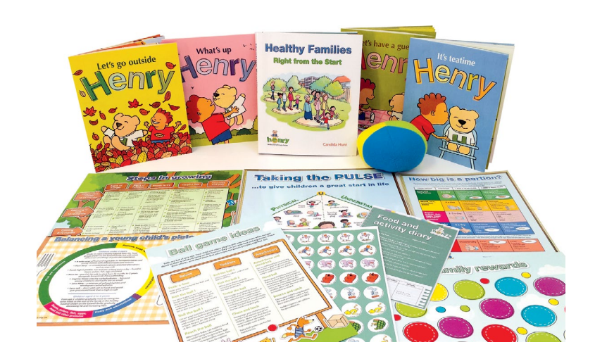
The HENRY Parent Toolkit

The HENRY toolkit will help you give your child a great start in life, get the whole family involved, and keep track of how well you're doing.